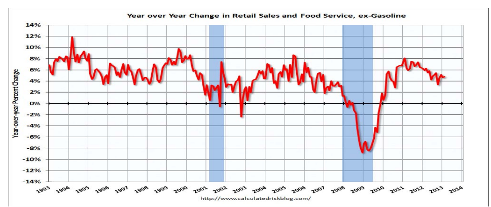
Graph: Calculated Risk

Consumers are buying, a reflection of improving incomes and the jobs market. The U.S. Census Bureau announced today that advance estimates of <u>U.S. retail and food services sales</u> for February, adjusted for seasonal variation and holiday and trading-day differences, but not for price changes, were $421.4 billion, an increase of 1.1 percent from the previous month and 4.6 percent above February 2012